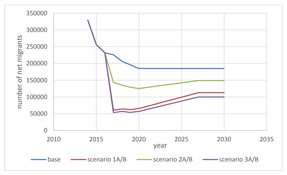
Figure 2: Net inward migration flows by year and simulation scenario