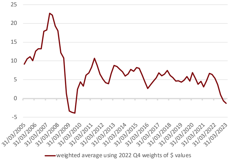
Figure 3 Global Liquidity Year-on-year percentage changes in $ and € credit to non-bank non-residents.