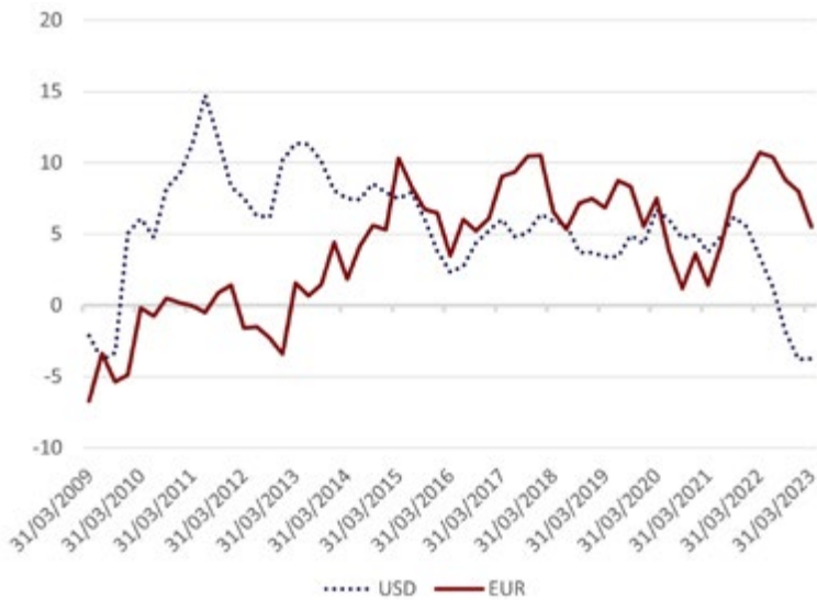
Figure 4 Global liquidity: the dollar versus the euro $ and € credit expansion to borrowers outside respective currency areas*

*Bank loans plus debt securities, annual percentage changes.