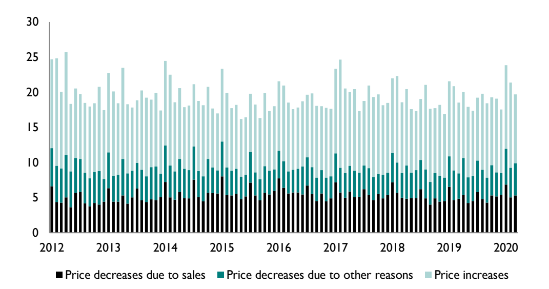
Figure 2 - Decreases due to sales, decreases due to other reasons and increases (per cent)

Note: Our measure of trimmed mean inflation excludes 5 per cent of the highest and lowest price changes. The level of trimmed mean inflation is typically lower than CPI inflation due to differences in how the largest price changes are treated and to how the prices are weighted.