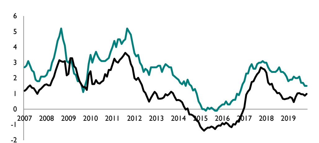
Figure 1 – CPI and trimmed mean inflation (per cent)

Note: Our measure of trimmed mean inflation excludes 5 per cent of the highest and lowest price changes. The level of trimmed mean inflation is typically lower than CPI inflation due to differences in how the largest price changes are treated and to how the prices are weighted.