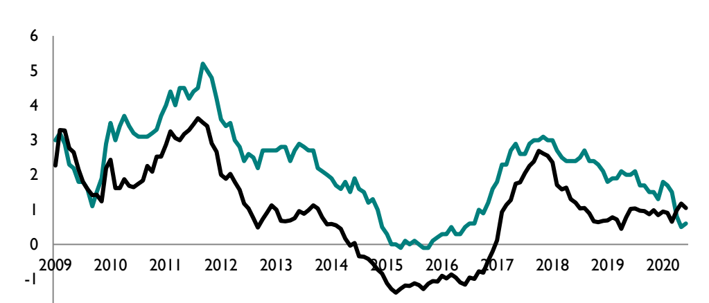
Figure 2 – CPI and trimmed mean inflation (per cent)

Note: Our measure of trimmed mean inflation excludes 5 per cent of the highest and lowest price changes. The level of trimmed mean inflation is typically lower than CPI inflation due to differences in how the largest price changes are treated and to how the prices are weighted.